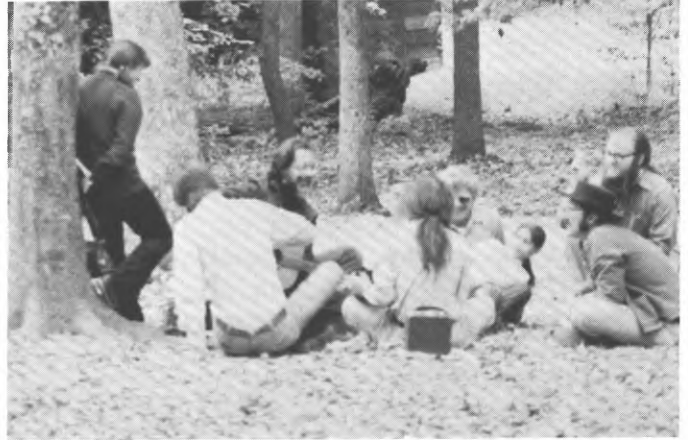
A small circle of friends at the Getaway.

If you FOUND a small, barrel-shaped, wooden container (of great sentimental value), let Linda know about that, too.