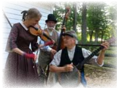
Cigar Box String Band