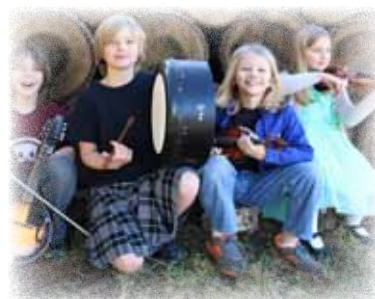
Sibling Rivalry Fiddle Band