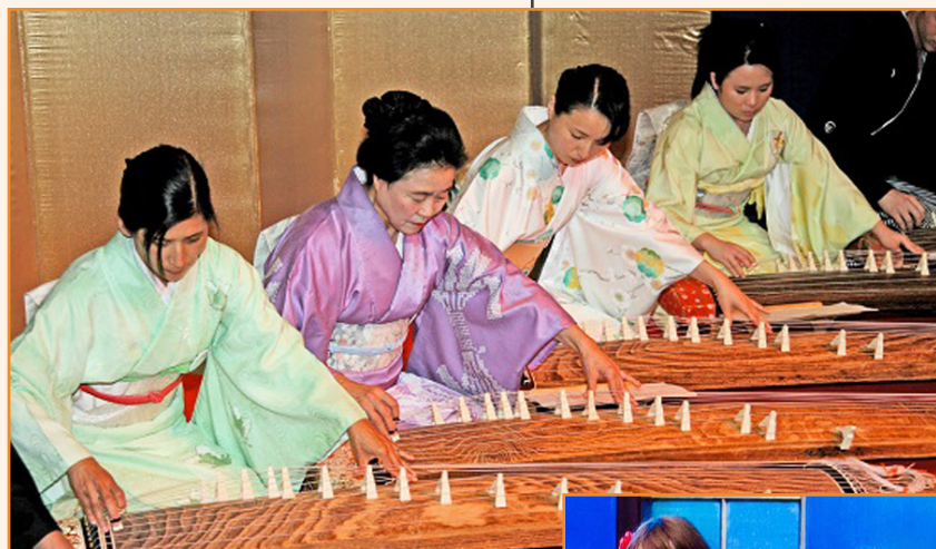
WASHINGTON TOHO KOTO SOCIETY

from the parking lot into the park! Showcases will highlight instrument styles and focus on unique woman songwriters. To celebrate the festival's 40th anniversary, organizers and musicians share ex-