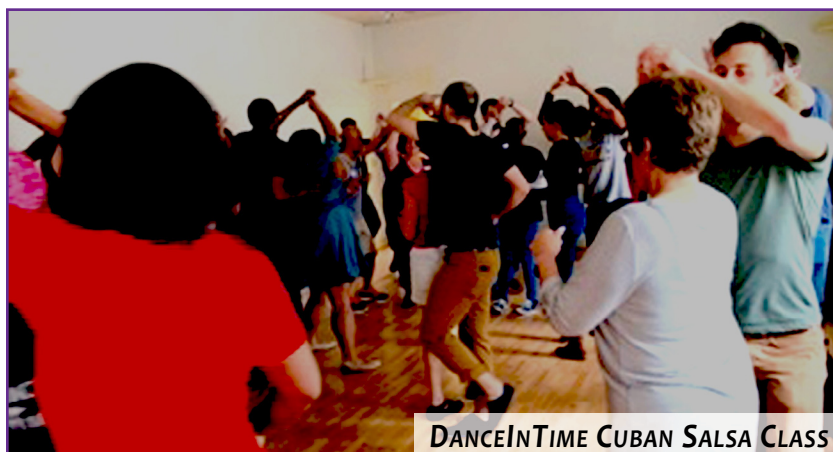
DANCEINTIME CUBAN SALSA CLASS

Info: carpediemarts.org/ daily-antidote-of-song