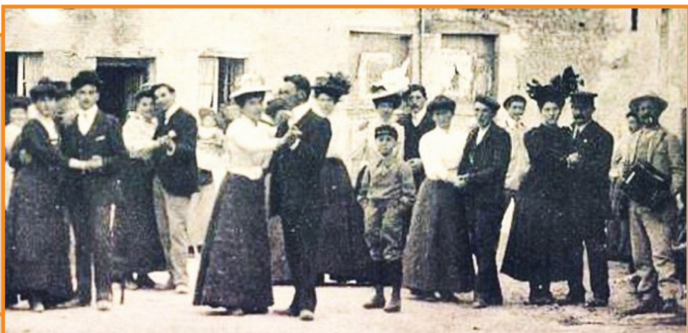
~ All dances taught, no partner needed! ~

*(There is NO JULY DANCE that was originally posted here.)