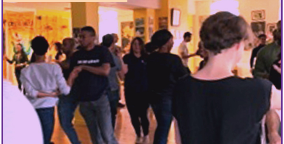
DANCEINTIME CUBAN SALSA CLASS