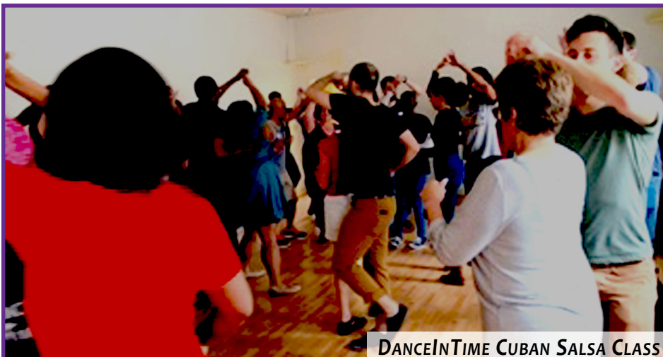
DANCEINTIME CUBAN SALSA CLASS