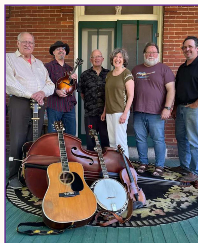
Tussey Mountain Moonshiners