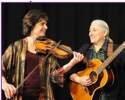
Simple Gifts (your host band)