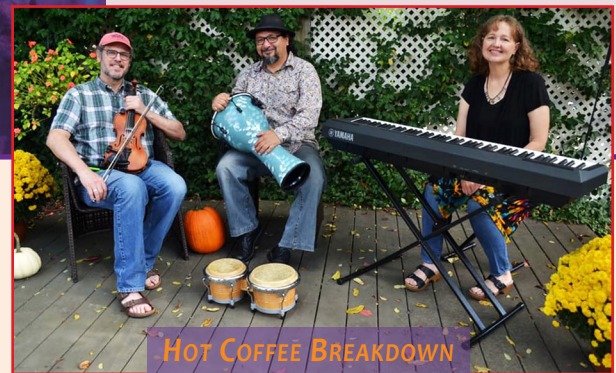
HOT COFFEE BREAKDOWN

FSGW is thrilled to return to the Woman's Club of Chevy Chase for another fantastic New Year's celebration.