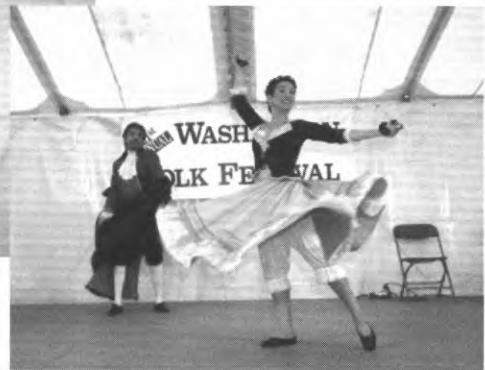
Past Washington Folk Festivals