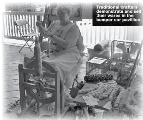
Traditional crafters demonstrate and sell their wares in the bumper car pavilion.