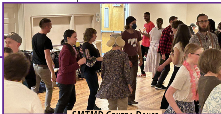
SMTMD CONTRA DANCE

NOTE: SMTMD follows the mandates of the St. Mary's County Health Department (SMCHD) with regard to COVID-19. Presently there are no mandates for vaccination, masks or social distancing in St. Mary's County. More information and guidance from the SMCHD on how to prevent the spread of COVID-19 can be found on their website HERE . While we would love to see you, we want you to be aware of the dancing conditions ahead of time so that you can make an informed decision.