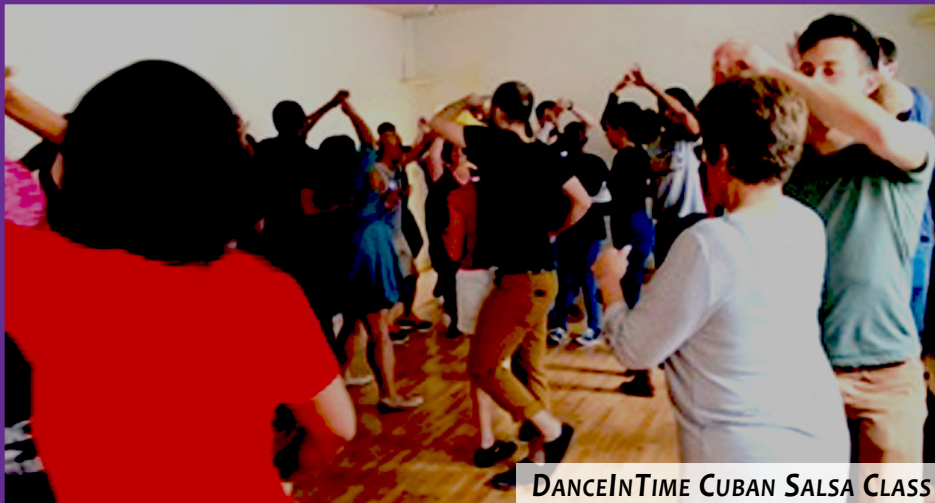
DANCEINTIME CUBAN SALSA CLASS