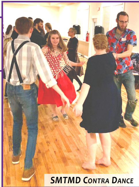
SMTMD CONTRA DANCE

Info: smtmd2@gmail.com , smtmd.org/#/dances